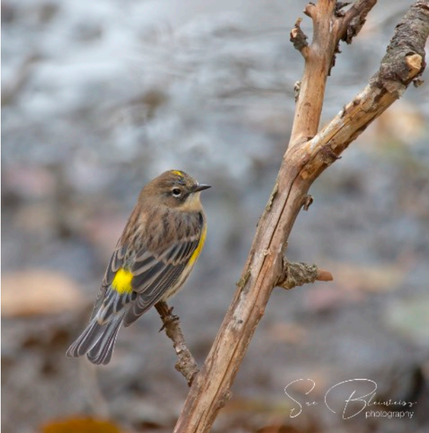
yellow rumped warbler

The count is open to everyone no matter how experienced a birder they are or where they live (i.e. you don't need to live within the count circle). Newcomers are welcome, and many more experienced birders embrace the company of novice birders for part or all of the day.