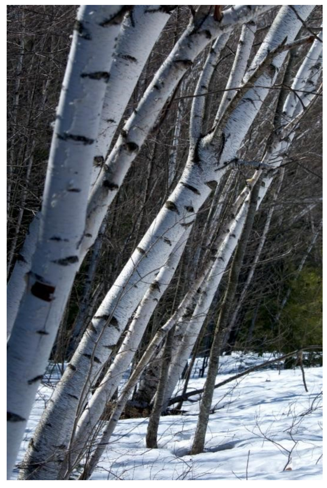
Birches at Heald Orchard