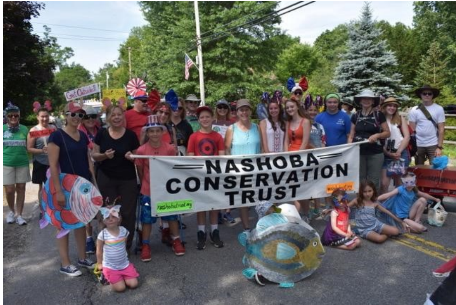
it's a Great Time to be in Pepperell