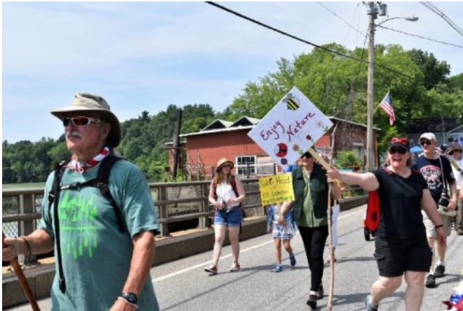
NCT member volunteers enjoying the parade on a hot July morning.