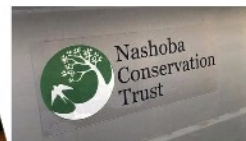
Window or bumper decals

Window or Bumper decal 3" X 6" $5.00 ea.