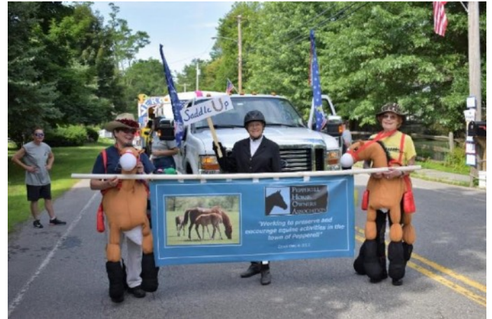
Members of the Pepperell Horse Association joined NCT in the parade