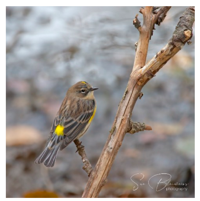
yellow rumped warbler

enjoy only about once in a decade. Pepperell counters even recorded three species that were found nowhere else in count circle; Pine Grosbeak, Ruffed Grouse, and Yellow-rumped Warbler. Thanks to all the NCT and other community members who helped to make our count a success this year!